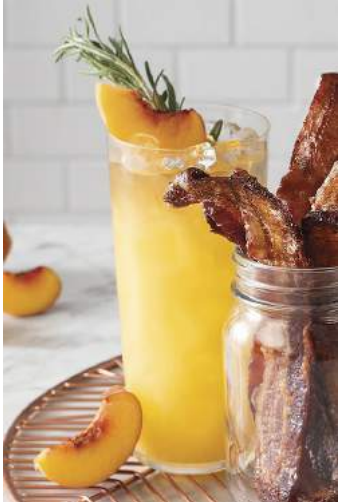
Mimosa's and bacon? Why not!