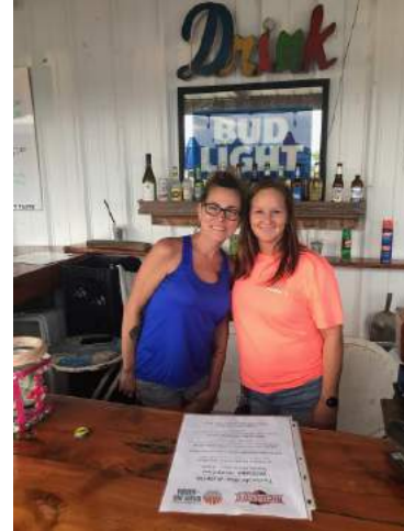
Salute to the Commander and the General!