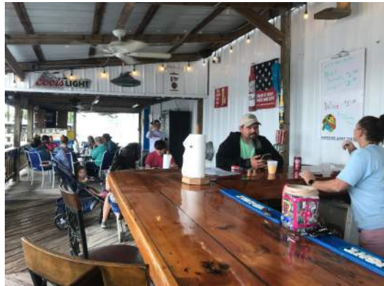
Customers enjoying breakfast and mimosas at the Dockside Bar and Grille Sunday.