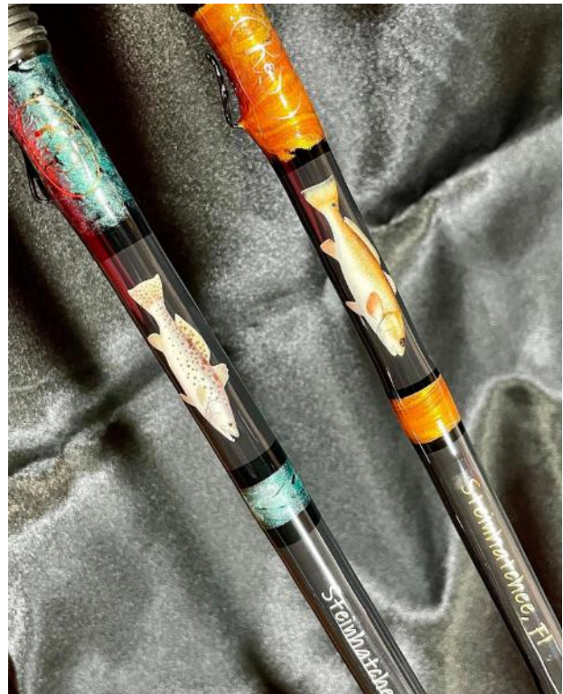
Our custom rods are in! □ These rods were built custom by R&S Rods & Jigs for Steinhatchee River Inn & Marina, equipped with the MicroWave Guide System and perfect for light saltwater fishing.

The Marina Store is stocked with bait, gear, beer, wine, food and beverages - everything an angler needs!