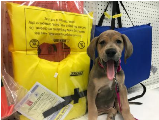
The number one rule of the water - be safe! We have everything you need to make that rule a priority.