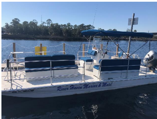
24 foot deck boat with 250 HP, rents off season for $225/day; $137.50 for half day.