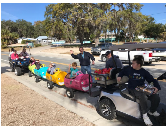
How precious is this a trainload of carolers from the First Baptist Church?