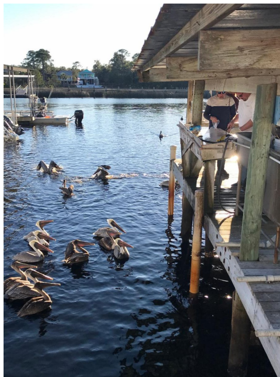
Pelican football line up while fish being filleted.