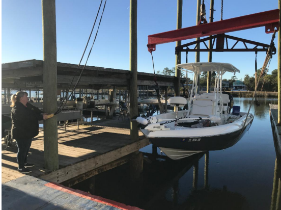
Our highly skilled boat lift operator, Leslie, carefully hoisting a boat.