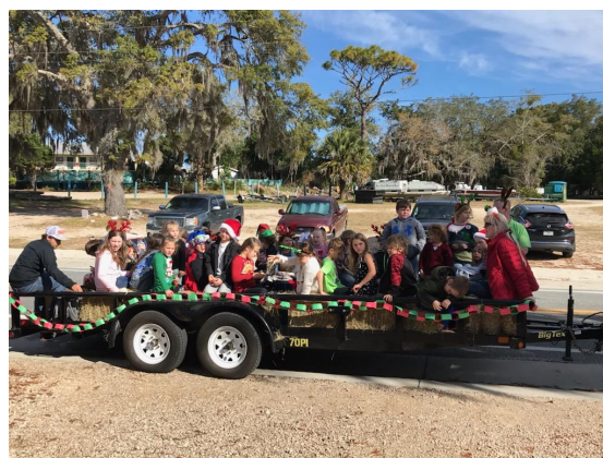
The youth from the Steinhatchee Boys & Girls Club stopped by for caroling.