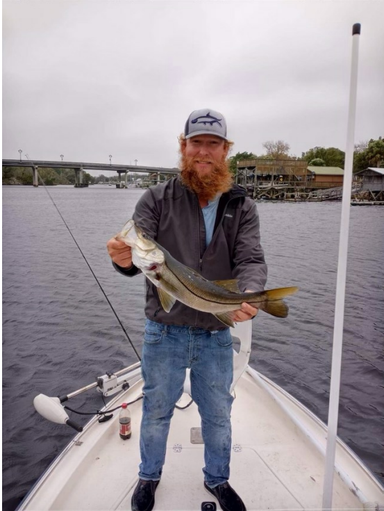
Snook caught and released on Christmas Eve right in front of our Marina.