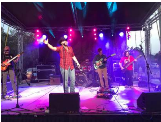
The Saturday night band at the Fiddler Crab Festival was jamming!