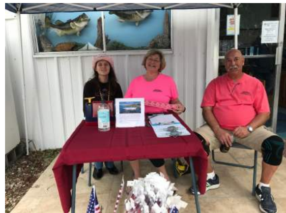
Thank you to our volunteers that worked the river tour signup table