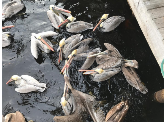
Pelicans fighting over fish scraps.