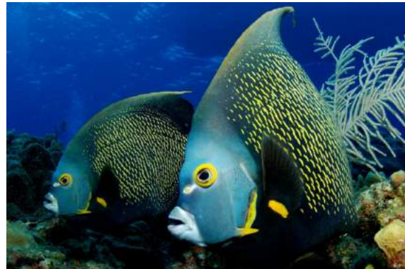
French Angel Fish