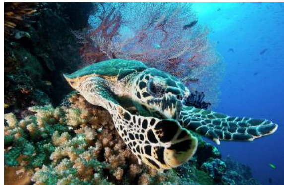
Hawksbill Sea Turtle