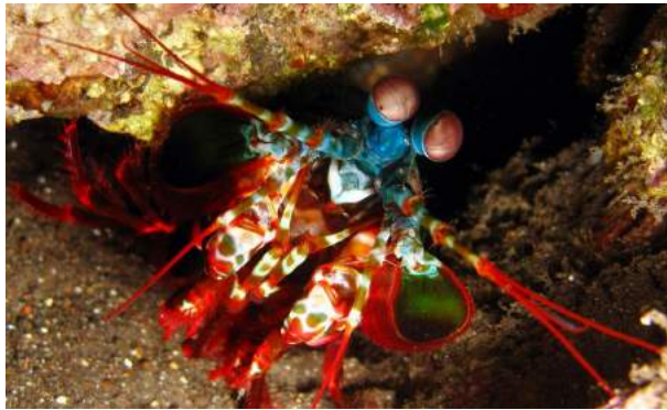
Peacock Mantis Shrimp

From our hearts to yours – Happy Valentine's Day!