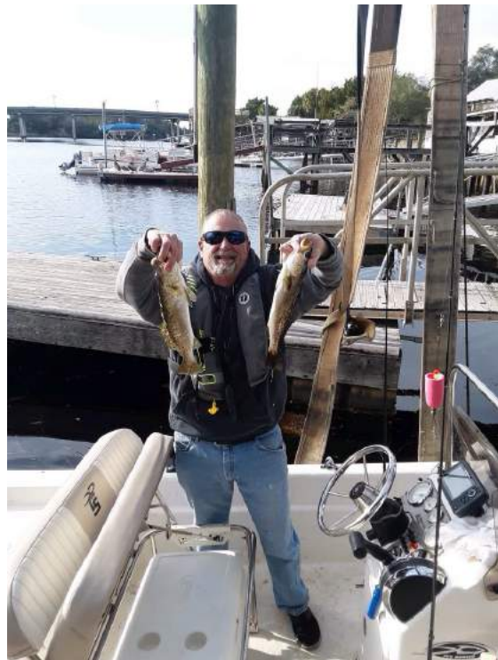
Sea trout caught January 17, 2021. Happy angler!