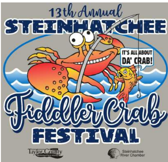
This year's festival will be scaled back a bit,