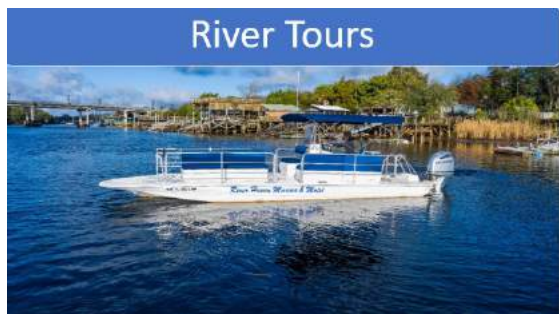
Always refreshing and never a disappointment, our Steinhatchee River awaits! The Steinhatchee River Inn & Marina is offering River Tours on Saturday, February 13th! Tours will begin at 11:00 a.m. and continue every hour, with the last boat leaving the dock at 3:00 p.m. Tours last 45 minutes. Tickets will be on sale in