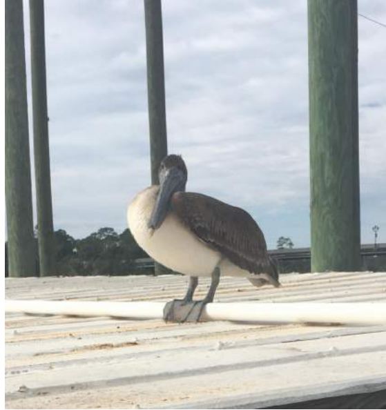
Somedays you just have to hang on and weather the storm.