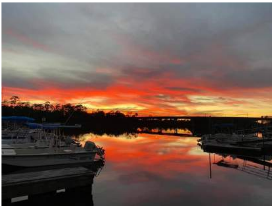
We've had beautiful endings...