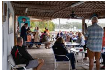
We appreciate all those who attended the Blessing.