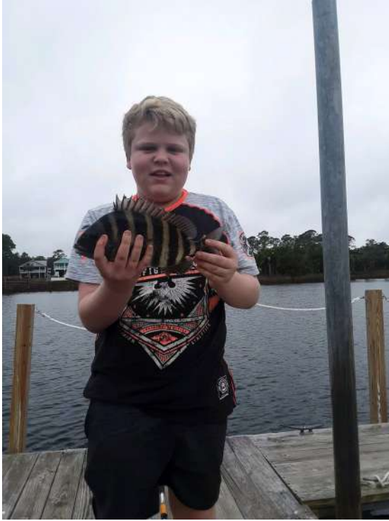
This young man caught a sheepshead right off our dock!