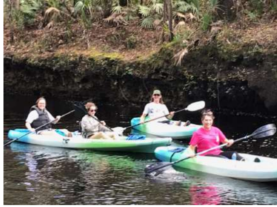
The Family that paddles together, stays together, even against the wind.