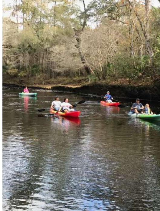
Family outing on a breezy day