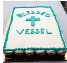
The cupcakes not only looked good, they also tasted great!