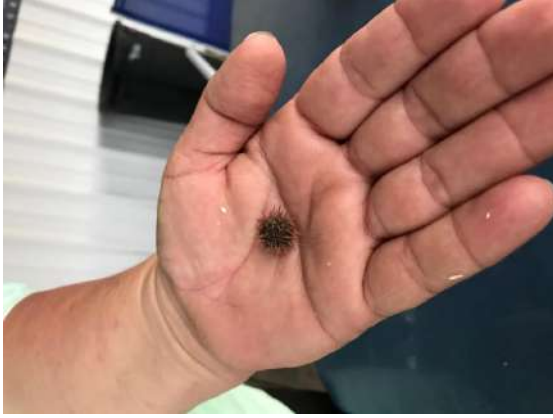
World's smallest sea urchin??