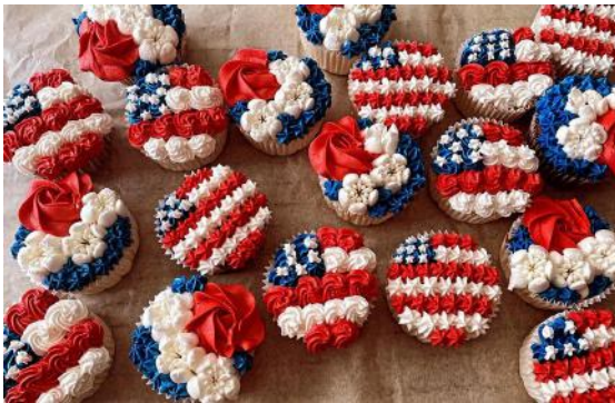
Seaside Sweets cupcakes were a big hit!