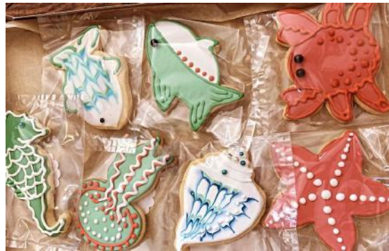
Seaside Sweets cookies were popular too!