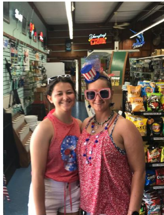
These girls know how to dress for the occasion! Love their spirit!