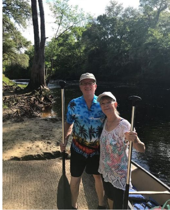
Retired Navy from Pensacola enjoying a paddle down river.