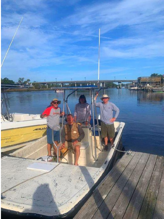
The Wetherington group heading out to the "fish market."