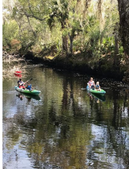
This family enjoyed kayaking the river.