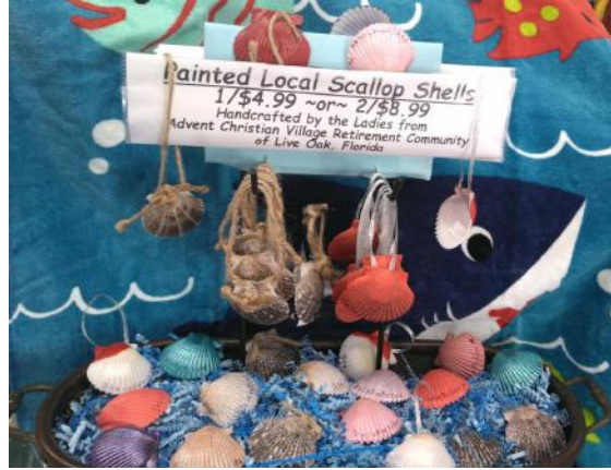
A sample of the painted scallop shells that are available for sale in the Marina store.