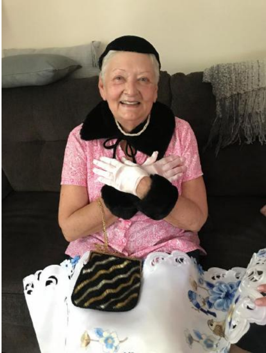
Meet Granny Gooma! When she's not glamming for the camera, she's painting scallop shells.