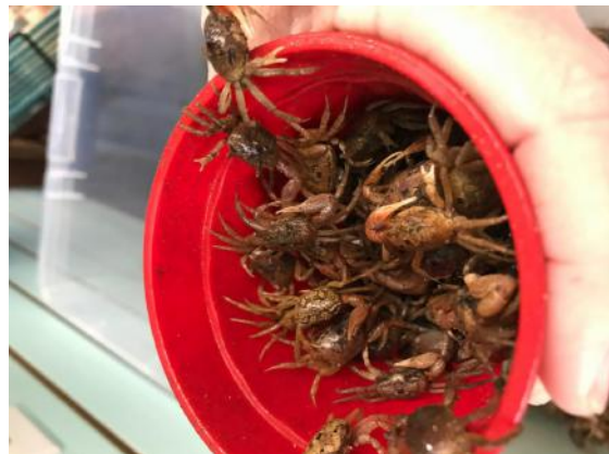
Fiddler crabs are available for $10/cup.