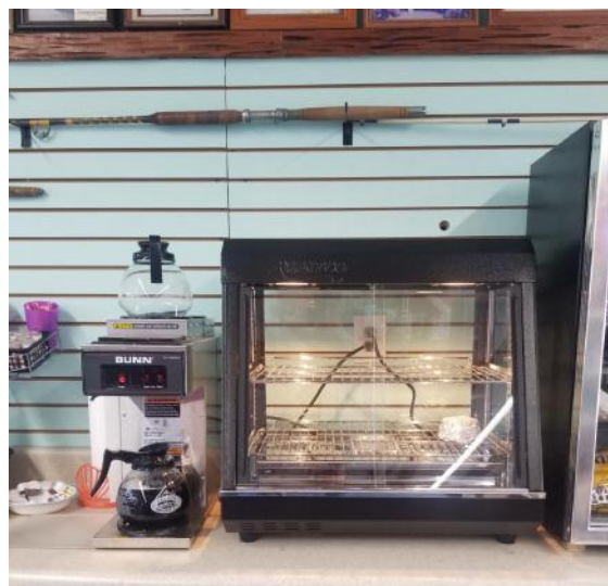
Available fresh every morning, breakfast sandwiches and apple fritters (made from scratch) are available every morning for a