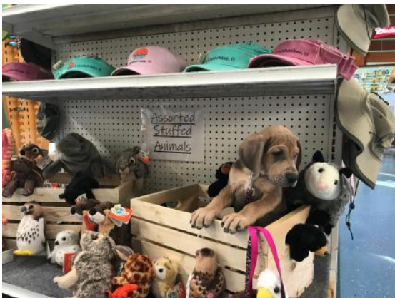
Our furry friends are flying off the shelf!