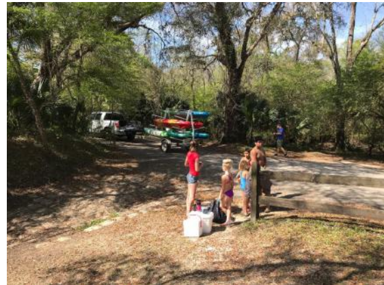
The kayak group, waiting to climb aboard.