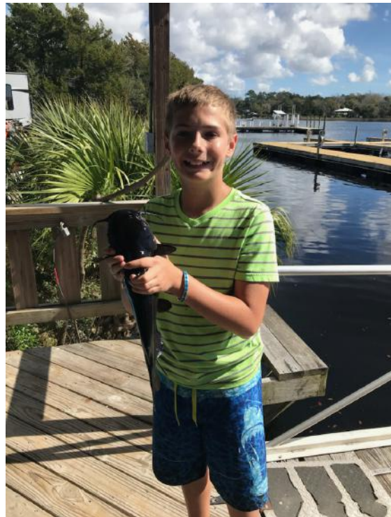
One happy boy and a not-so-happy catfish