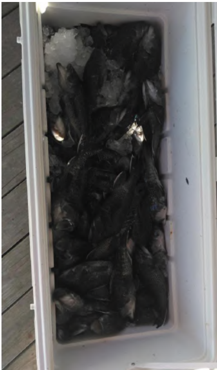
A peak inside the Orr fishing team cooler sea bass and pink mouth grunt.