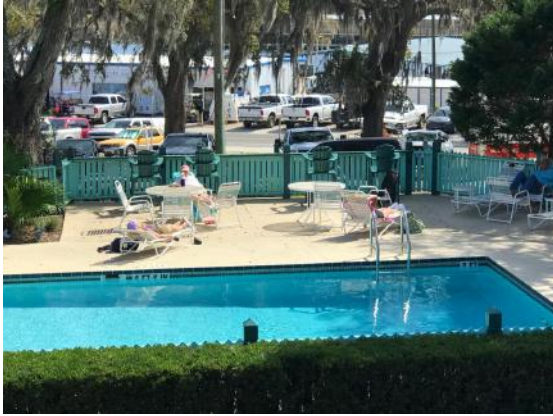
Our guests at the Inn enjoy ending their day of fishing with a dip in the pool