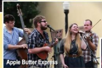
Apple Butter Express