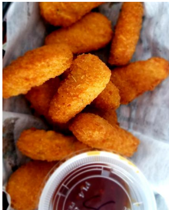
Our crab poppers are the hottest thing going! Served with a sweet chili sauce, Rob's own secret recipe.