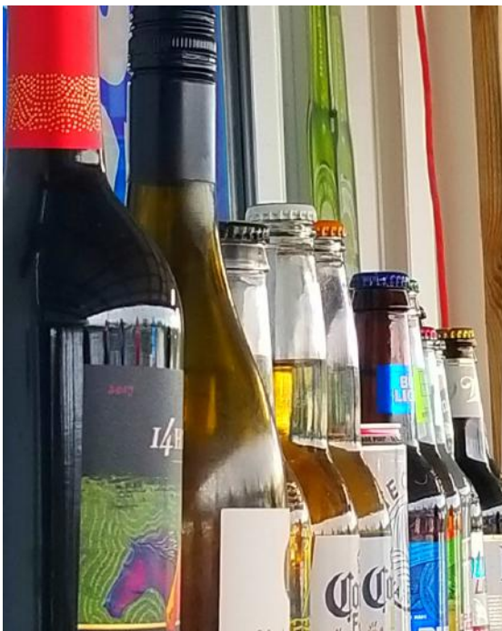
Serving ice cold beer, wine and non-alcoholic drinks. Don't forget, Mimosas Saturday and Sunday mornings!