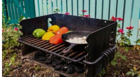
We've seen some pretty incredible meals cooked on these grills! Talk about fresh catch - some of our guests step off the boat, and grill their catch of the day!