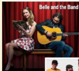
Belle and the Band