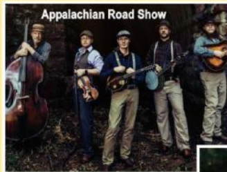
Appalachian Road Show

FREE ADMISSION FOR TAYLOR COUNTY RESIDENTS