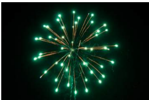
Fireworks are being shot off on