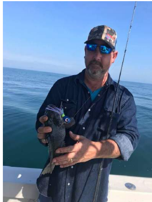
...the score was Squid 12, Confidence Jigs 77.