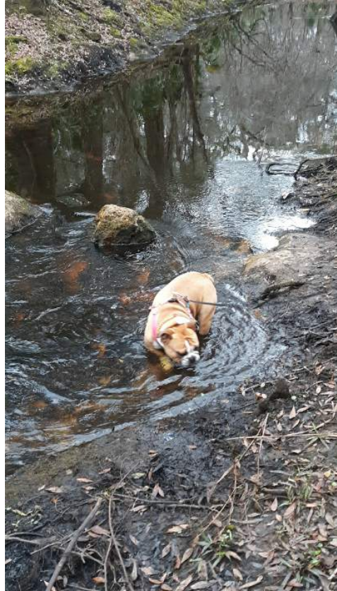
Carmela (Apley) wasn't much on fishing but sure did enjoy the Falls!