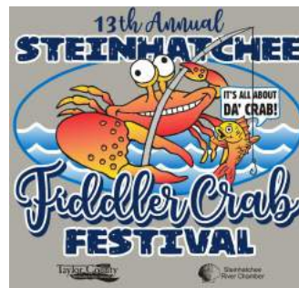
Got 4 hours to spare? The