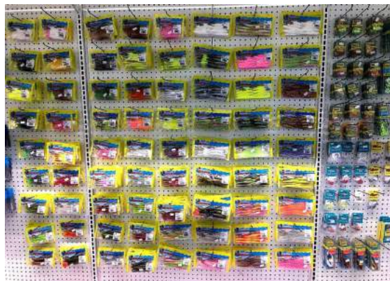
The Bass Assassin isle is stocked!